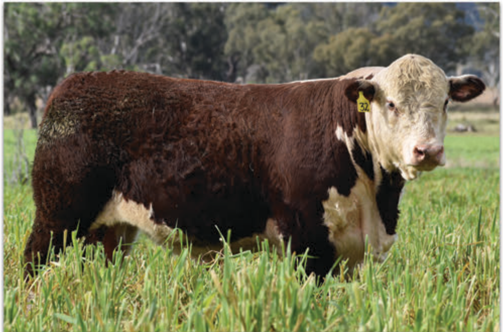
Lot 32 Mountain Valley Roper R404 (AI) (ET) (PP)