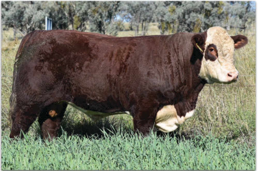
Lot 6 Mountain Valley Spotter S005 (PP)