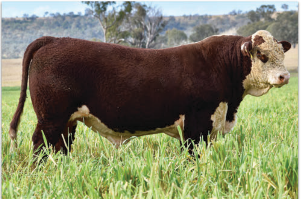
Lot 7 Mountain Valley Randwick R133 (PP)