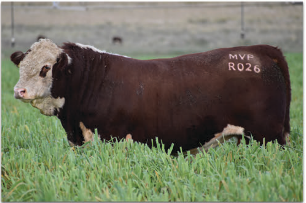
Lot 11 Mountain Valley Racquet R026 (AI) (PP)