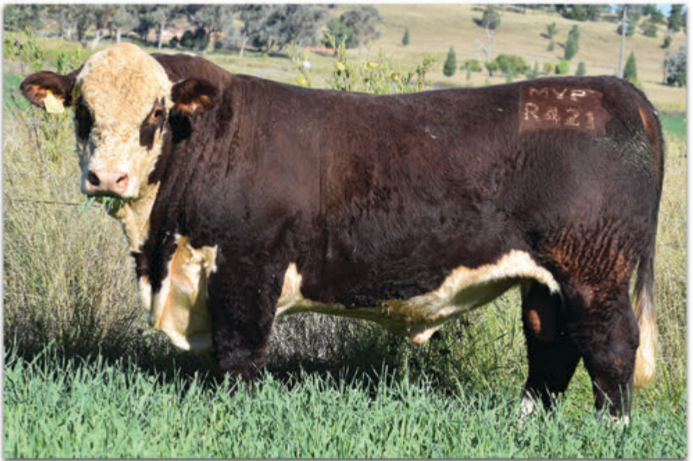
Lot 2 Mountain Valley Roger R421 (AI) (ET) (PP)