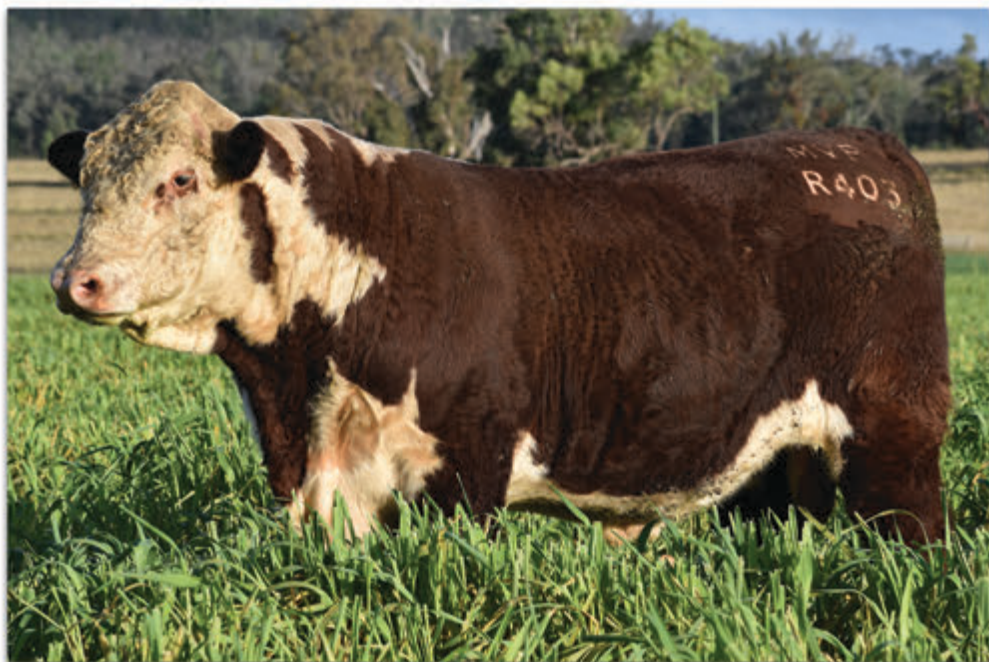
Lot 8 Mountain Valley Ringwood R403 (AI) (ET) (PP)