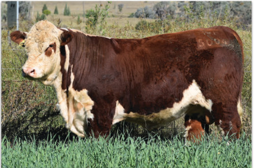
Lot 5 Mountain Valley Saleo S004 (PP)