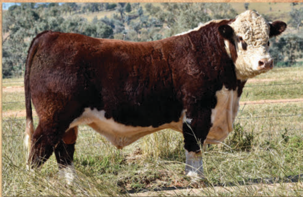
Sire The Ranch Payroll DLRP031