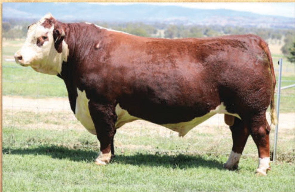
Sire Injemira Techno IHSN276