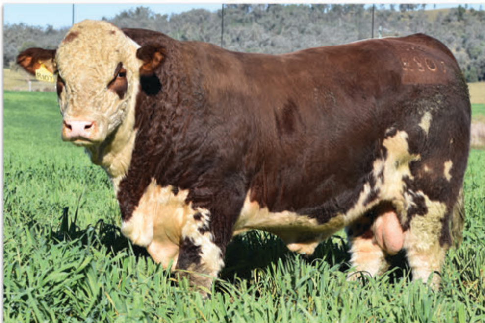
Lot 9 Mountain Valley Realist R107 (P)