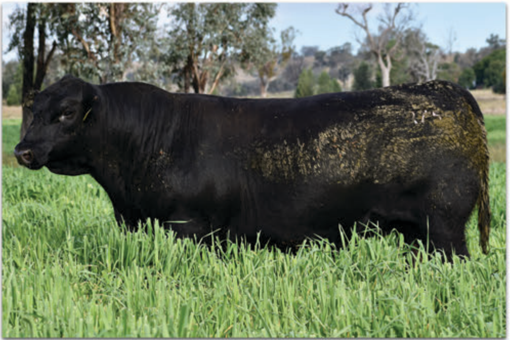
Lot 57 Mountain Valley Naxos R755 SV