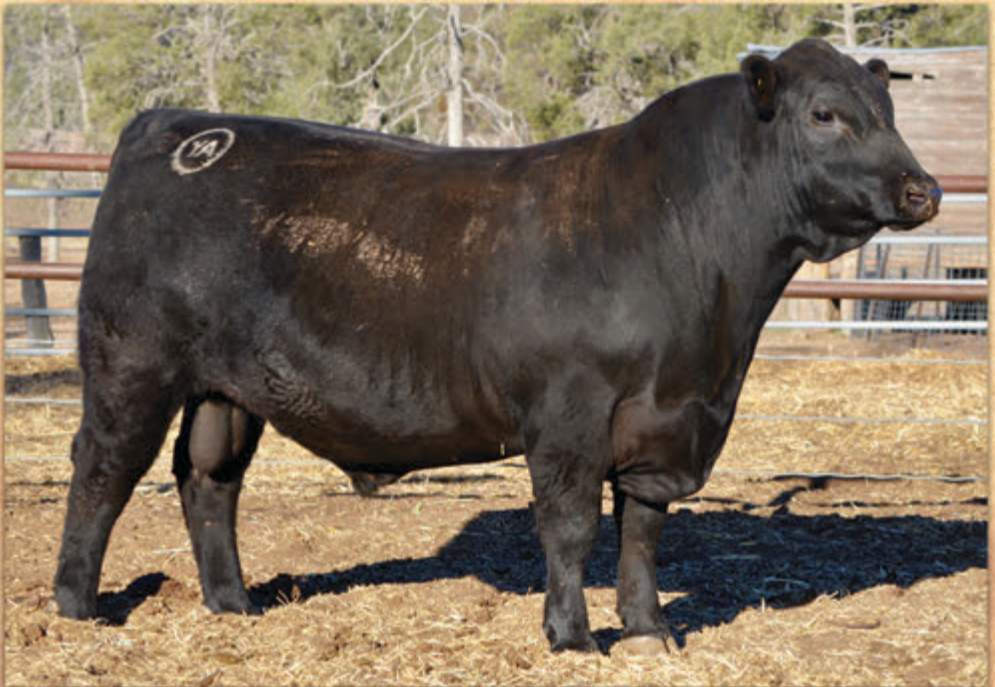
Sire Yamba Naxos DZNN190