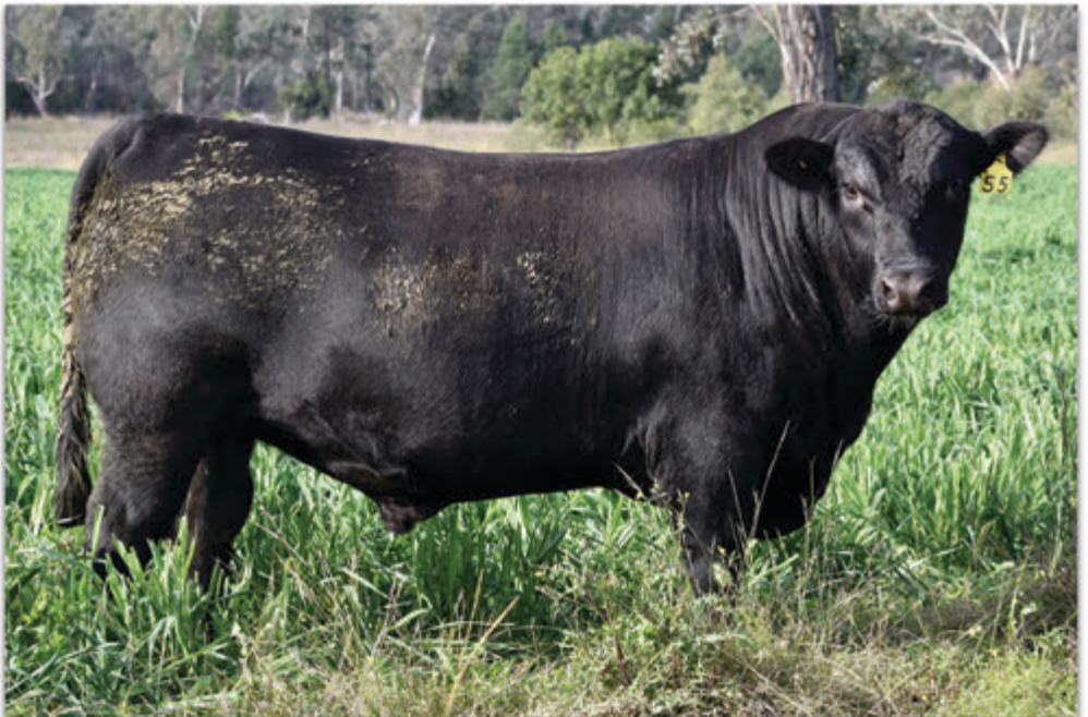
Lot 55 Mountain Valley Parson R744 SV