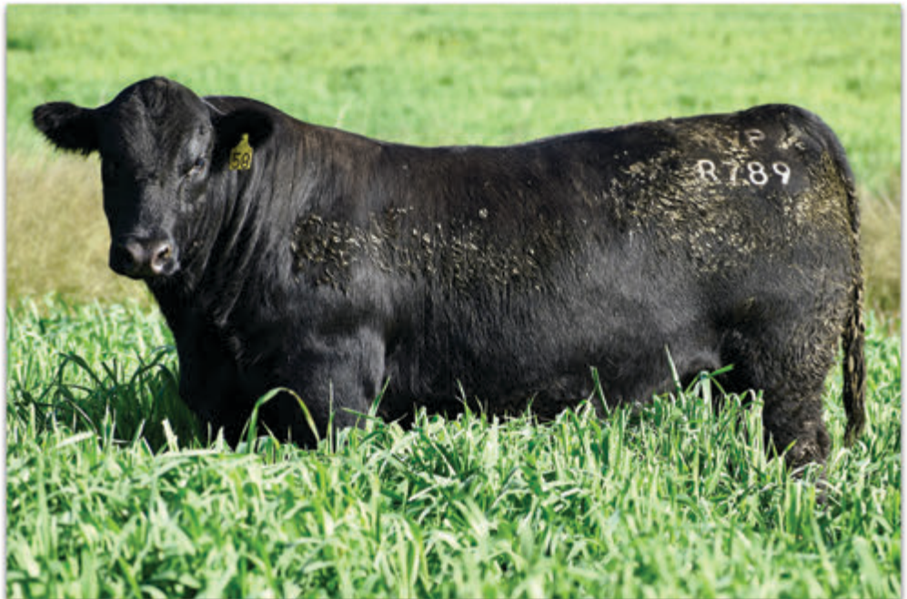
Lot 58 Mountain Valley Naxos R789 SV