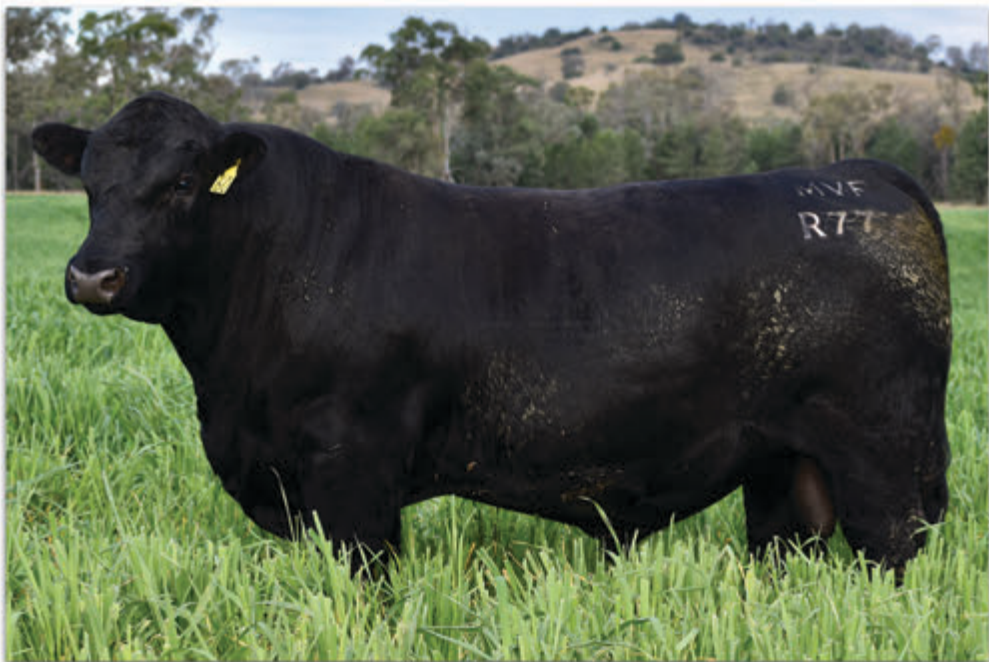
Lot 60 Mountain Valley Gabba R777 SV