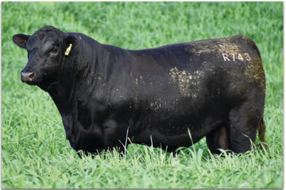
Lot 49 Mountain Valley Parson R748 SV