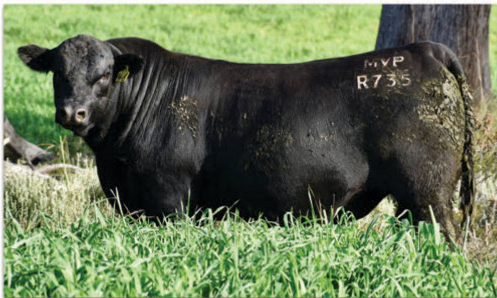
Lot 46 Mountain Valley Parson R735 SV

Bull Sale is at Mountain Valley 1220 Coolatai Road Coolatai NSW 2402