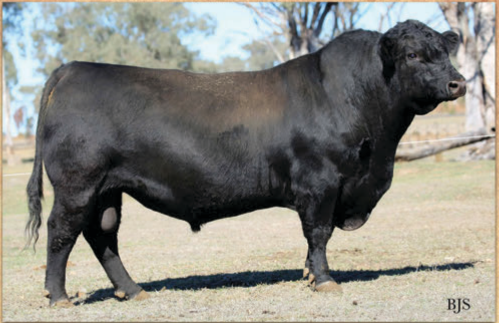
Sire Peakes Gabba EVTK556